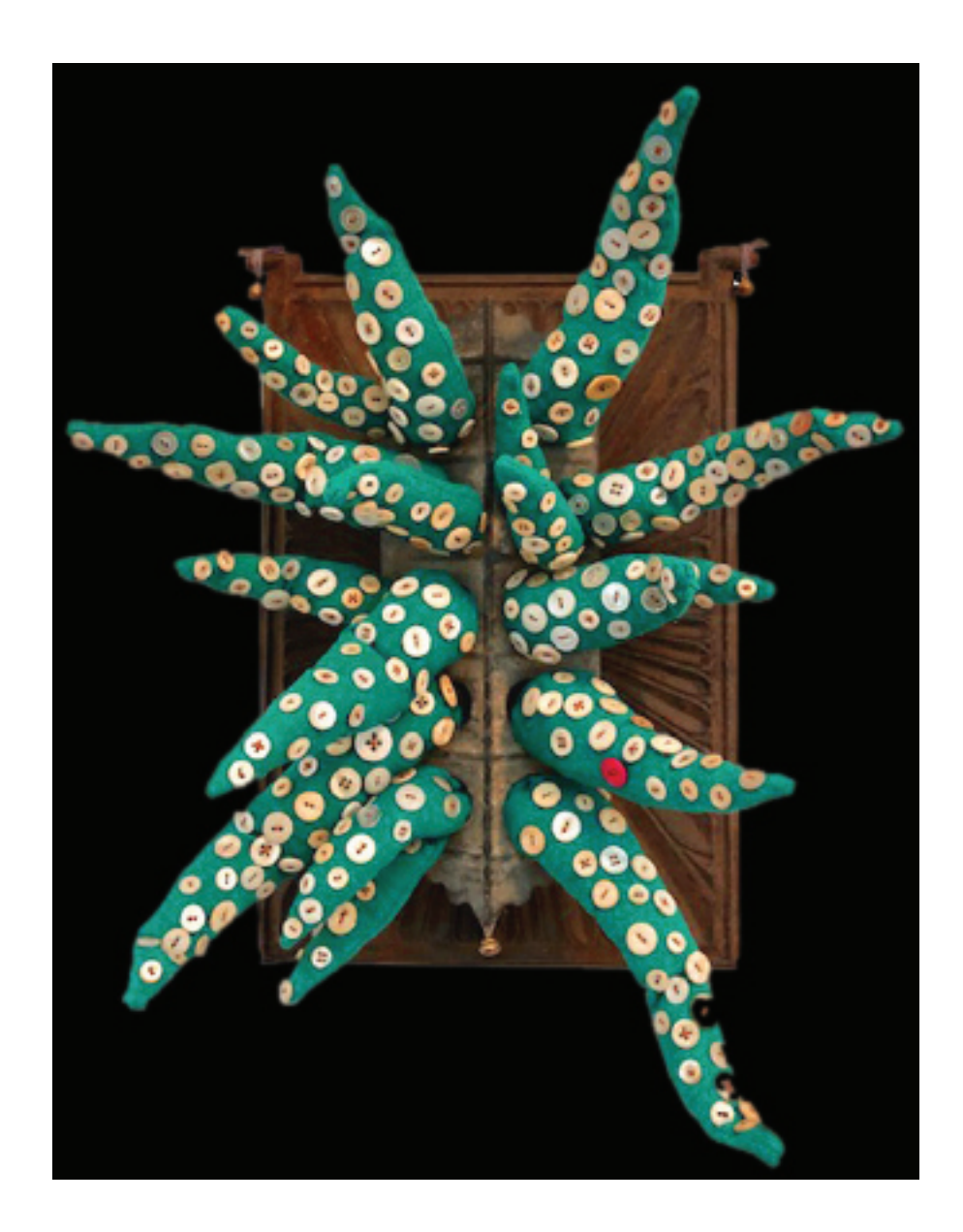
No. 17 by Michelle Law

Gorey material: Green linen mandarin collar shirt, galvanized metal chicken feeder, cast iron chimney door.